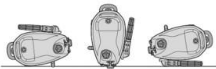
Three directions horizontal storage